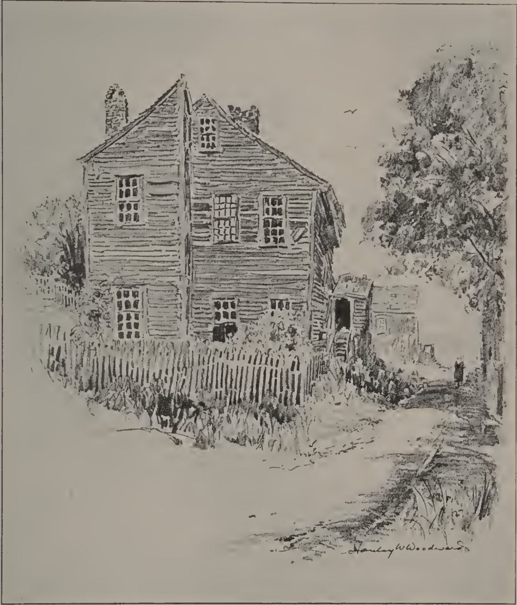
SALUTATION ALLEY, MARBLEHEAD